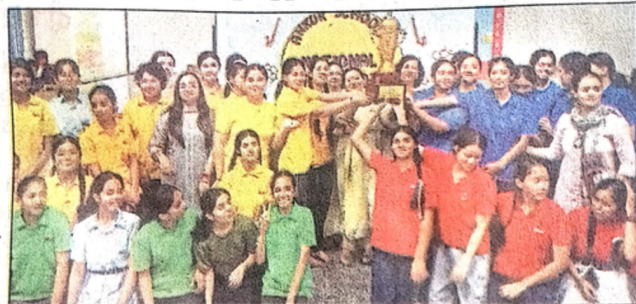
राष्ट्रीय खेल दिवस में पदक विजेता छात्र एकसाथ।