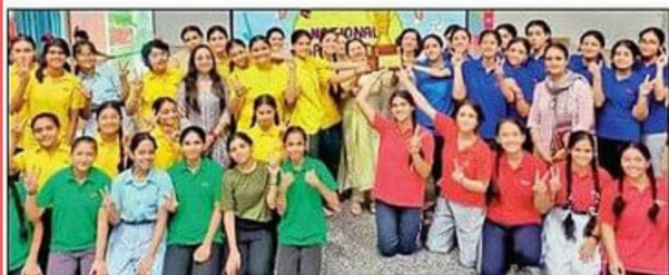
अंकुर स्कूल-14 में खेल दिवस पर आयोजित प्रतियोगिता के विजेता छात्र।